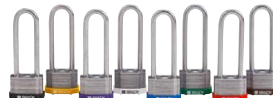
Key-Retaining Steel Lockout Padlocks with 3 in. shackle

When keyed alike, all locks in a set can be opened with the same key. This option is beneficial when multiple locks are assigned to a single employee.