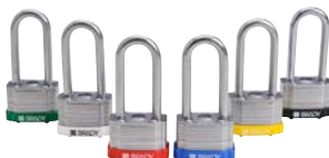
Key-Retaining Steel Lockout Padlocks with 2 in. shackle