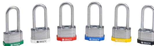
Steel Lockout Padlocks with 2 in. shackle