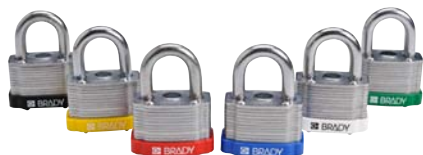
Steel Lockout Padlocks with 0.75 in. shackle