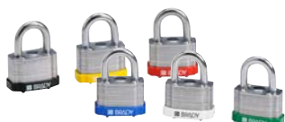
Key-Retaining Steel Lockout Padlocks with 0.75 in. shackle