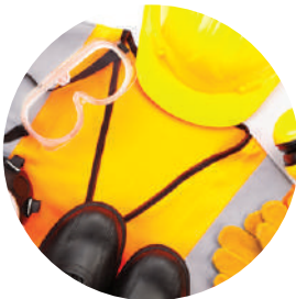
PERSONAL PROTECTIVE EQUIPMENT

During projects, there can be an influx of contracted work - we can help with site-wide compliance by providing readily accessible PPE and tools.