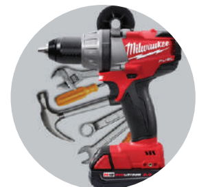
HAND TOOLS & POWER TOOLS