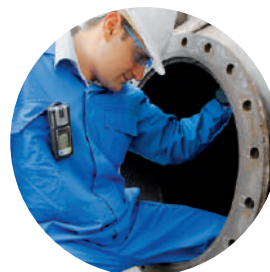
GAS DETECTION RENTALS (SINGLES, MULTI-GAS)