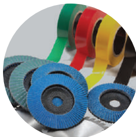
ABRASIVES, TAPES, ADHESIVES